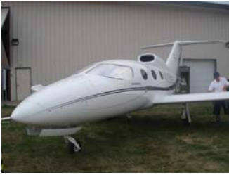
From Old to New